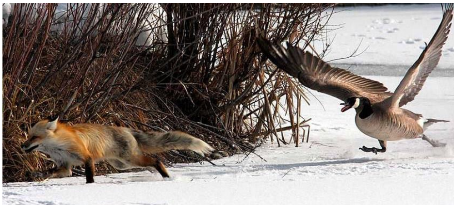
Wildlife thriving in North America