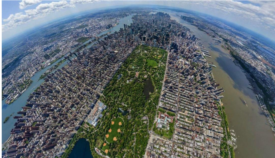
New York City, USA with Central Park